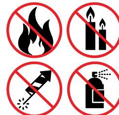
FLAMMABLE ITEMS OR LIQUIDS (INCLUDING AEROSOLS, FIREWORKS AND CANDLES, EXCEPT LIGHTER)