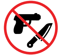
WEAPON AND/OR ANY SHARP OBJECTS