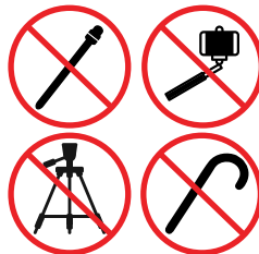
POLES, STICKS, OR "TOTEMS" (INCLUDING SELFIE STICKS, ACTION CAMERA STICKS, CAMERA POLES AND/OR TRIPOD)